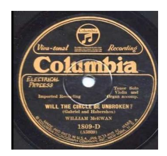
KEEP THE CIRCLE GOING

If you want to try the tune in the key of G, place your capo on the 3rd fret for a different sound.